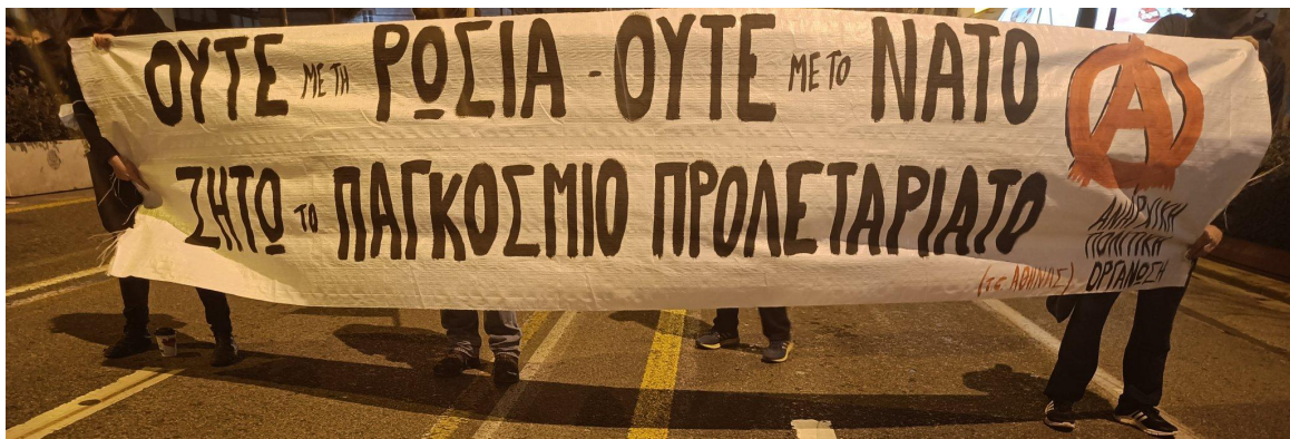
During demonstrations on the evening of March 1st, Greek anarchists carried a banner through the streets of Athens that read: "NEITHER RUSSIA NOR NATO. FOR THE GLOBAL PROLETARIAT"