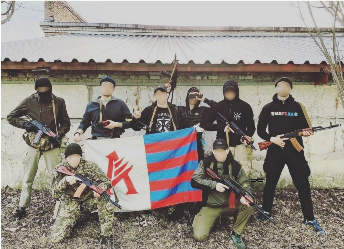
Anti-fascist militants from the Arsenal Kyiv football team