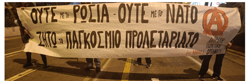
During demonstrations on the evening of March 1st, Greek anarchists carried a banner through the streets of Athens that read: "NEITHER RUSSIA NOR NATO. FOR THE GLOBAL PROLETARIAT"

Among Greek anarchists, as well as anarchists in Latin America with whom the former have had a close historical and cultural affinity since the mid-20th century (largely owing to a similar US/NATO foreign policy in both's geographic regions), there has been a particular focus on the US's double-dealing with Russia, as well as its perceived insatiable imperialism. Like their Italian counterparts, the Greeks too have plenty of historical grievances with NATO and the US related to meddling in their own affairs. They have also given significant attention to the fascist elements of past Ukrainian post-Yanukovich administrations and to those presently within the armed forces of Ukraine, while there has been no lack of solidarity for the Ukrainian people among Greek anarchists. Perhaps complicating the matter for Greeks of any political persuasion is a historical relationship with Russia going back to the Greek War of Independence (1821-1829), in which Russia militarily intervened on Greece's behalf. Demonstrations in Greece have maintained a general solidarity with the victims of all wars and opposed state violence.