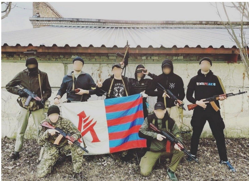
Anti-fascist militants from the Arsenal Kyiv football team