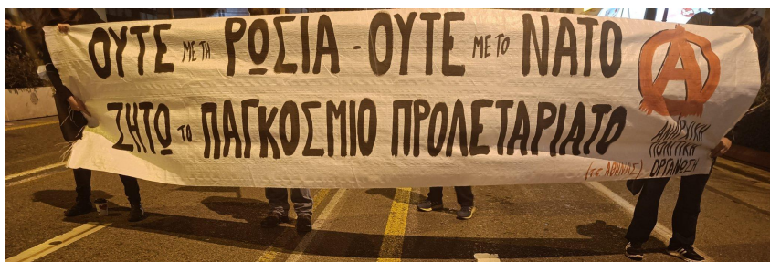
During demonstrations on the evening of March 1st, Greek anarchists carried a banner through the streets of Athens that read: “NEITHER RUSSIA NOR NATO. FOR THE GLOBAL PROLETARIAT”

Closer to the conflict, anarchists in Germany have been supportive of the broader resistance in Ukraine, while naturally maintaining their critiques of NATO and their condemnation of overtly fascist divisions within the Ukrainian Armed Forces. Perhaps owing to the restrictions and scrutiny imposed upon them by local law enforcement, or the risks involved in traveling to the fronts in Ukraine, German anarchist action in support of the Ukrainian resistance has so far primarily focused on mutual aid and demonstrations of solidarity with both antifascist Ukrainian fighters and refugees. This is likely to change if the conflict drags on, and Germans are one of the more probable nationalities to fight alongside Ukrainian anarchists in the event of a protracted war.