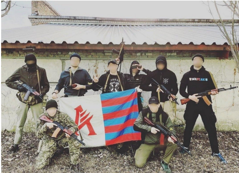
Anti-fascist militants from the Arsenal Kyiv football team

guments made by anarchists to the effect that NATO encirclement of Russia has made this conflict inevitable on Russia's part. Still, an overtly pro-Russian position has been hard to come by from anarchists, at least regarding the ongoing hostilities in Ukraine.