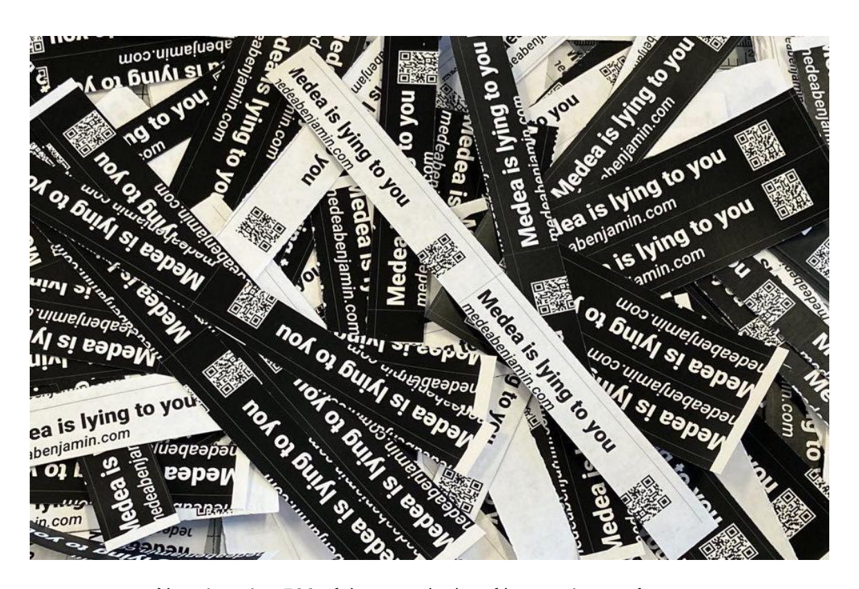
Now, imagine 500 of these and a lot of larger pieces of paper.