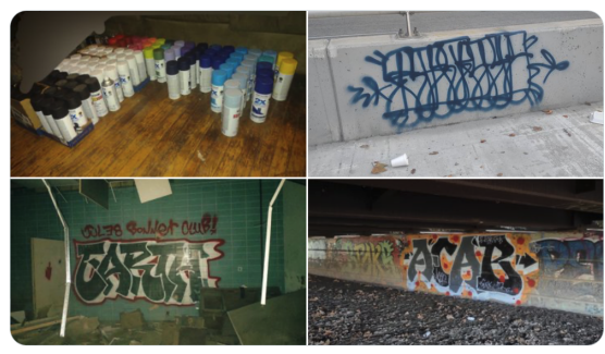
9:07 am · 20 Oct 2022